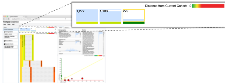
Figure 3: A visual analytics system instrumented to detect selection bias during exploratory data selection. The bread-crumb view in the callout shows increasing drift (lighter green bars) moving back from the current analytical focus (right) to the original cohort (left).

Most critically, omitting dimensions from a visualization can hide issues such as selection bias introduced during filtering and zooming. Recent research has shown that the effects of selection bias in high dimensional visualization can be communicated to users by capturing a user's exploration history and visualizing differences in variable distributions across that history (Figure 3). 12 Future innovation in this area, including capturing more complex analyses and integrating methods to correct for bias (e.g. post-stratification 13 ) is necessary to make ad hoc exploratory visual analysis more robust