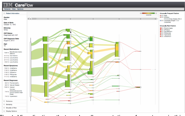
Fig. 1. Visualizations that render all permutations of events, as in this example showing differences in the order of medications given to a cohort of heart failure patients [1], fail to scale given large numbers of events.