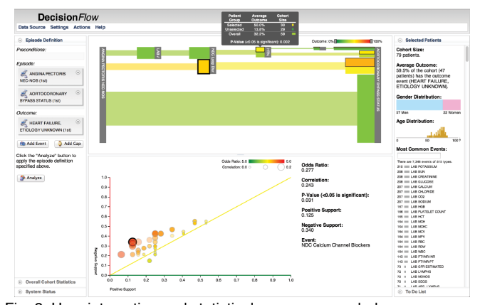
Fig. 2. User interaction and statistical measures can help users manage high-dimensional event sequences, but existing methods (e.g., DecisionFlow [4]) typically place hard constraints on event order within patterns.